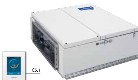
The photo is intended for informational purposes only, exact details may vary.